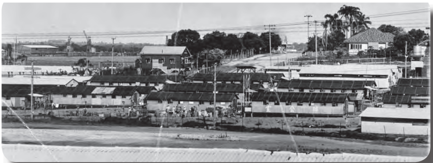
Chinese camp at Bulimba during World War II.