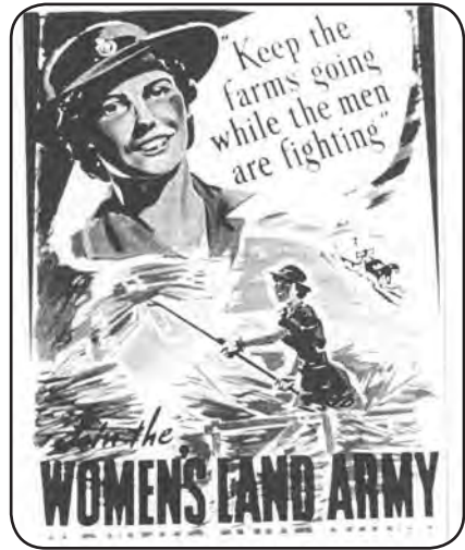
Figure 5.

sunflowers — the first experimental sunflower crop to be grown in the area. Cooke had to individually turn down the heads of the flowers to stop rain rotting the seeds. She stayed on in the job after the war and received rates of an experienced, agricultural worker. 19