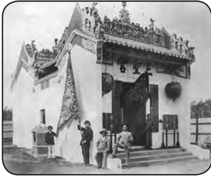
Chinese Joss House, Breakfast Creek, 1886.