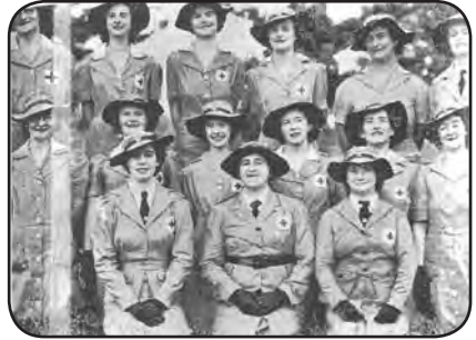
Rockhampton branch of Red Cross VAD (No 1 Detachment).

Despite the allegations that boyfriends in the militia were training some of the women in certain things in their spare time, and that some women were wearing their uniforms without earning the privilege, Rockhampton women took their training seriously: 519 passed First Aid exams and 319 passed Home Nursing exams. 16